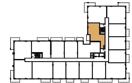
FLOORS | ÉTAGES 2-10